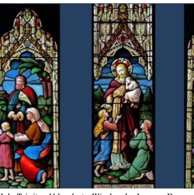
Holy Trinity, Aldershot. Window by Lavers, Barraud and Westlake (1893)